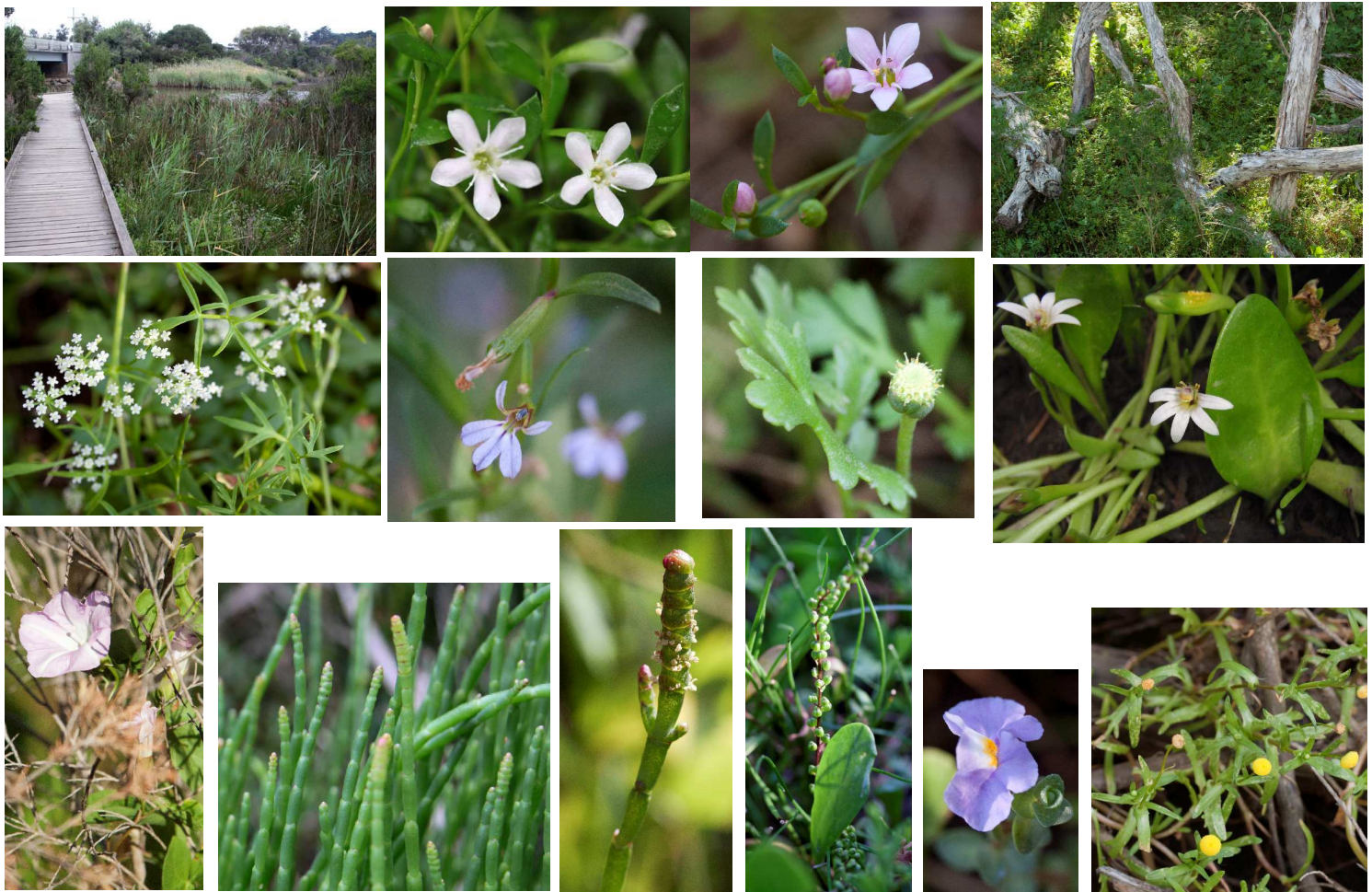
Salt marsh species, largely low-growing, found in the Balcombe Estuary Reserve

To cope with the salinity, some plants isolate salt in structures in their succulent leaf and stem tissue. Others excrete salt onto the leaf surfaces, while some simply tolerate high salt concentrations in their tissues. Plants that are periodically submerged mostly have ways to reduce their oxygen need during these times. Sedges and rushes in salt marsh have hollow vessels in their stems and leaves to carry oxygen to their roots.