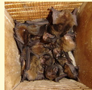
Gould's Wattled Bats

With few remaining old trees with hollows, the boxes provide roosts for our many microbats. Paul checks the boxes regularly to see whether bats are using them, make sure that invaders (ants, bees) don't move in, and check that the boxes are in good order. For enquiries, call Paul on 0438 681 946.