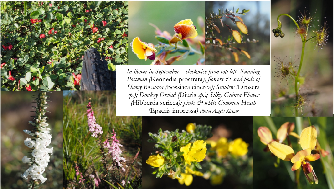
In flower in September – clockwise from top left: Running Postman ( Kennedia prostrata ); flowers & seed pods of Showy Bossiaea ( Bossiaea cinerea ); Sundew ( Drosera sp.); Donkey Orchid ( Diuris sp.); Silky Guinea Flower ( Hibbertia sericea ); pink & white Common Heath ( Epacris impressa )

A profusion of insects is making use of the changed landscape and many small skinks have been seen foraging in the leaf litter during