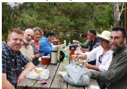
A picnic lunch at The Briars during a field day

Field trips were a highlight as we saw, at various places on the Peninsula, the results of habitat management. The basic philosophy was protect the best , allow remaining indigenous flora to revegetate by clearing threats such as introduced weeds. We learned to use herbicides only when other options are unlikely to succeed, and to be careful about the provenance of seeds when planting – the best seeds are those sourced really locally.