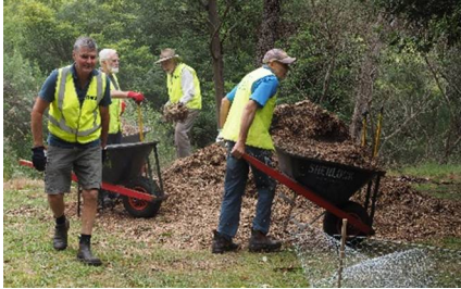
Division of labour! The guys barrowed and the gals weeded at the February working bee

At the February Sunday working-bee we once again mulched and weeded below the Balcombe Pre-school on Hopetoun Creek in preparation for extensive planting this autumn and winter. It is really looking good – a great effort.