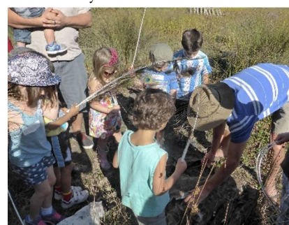
What's under this stone? Will waving peacock feathers over it help?!