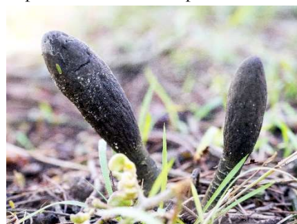
Above, Cordyceps gunnii and below, the pupa cases, both under a under the Black