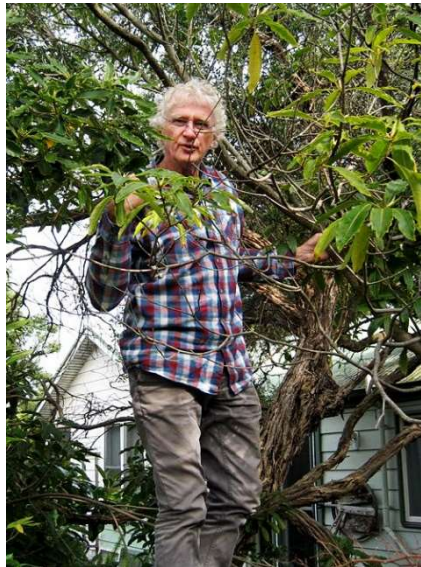
Where better to find our new Patron, Terry Denton, than up an indigenous Teatree considering the invading branches of a weedy Pittosporum!

And he intends to be actively involved with BERG MM in our events. He would love to say hello to you – and sign your children's books – when you meet him.