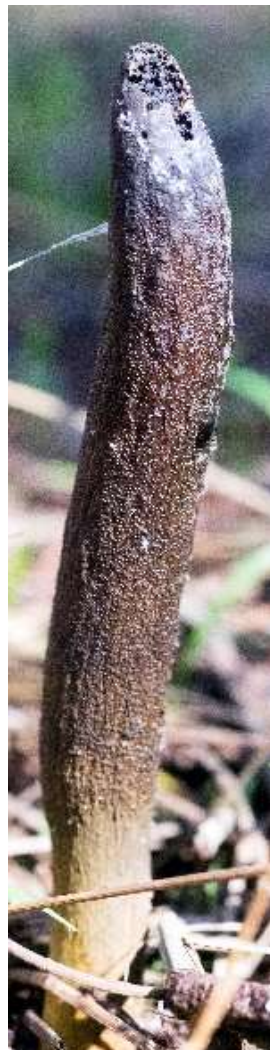
Cordyceps gunnii enlarged – the white fluff is the tiny thread-like spores, which will penetrate the ground and infect caterpillars

Cordyceps , Fuhrer's Field Guide to Australian Fungi tells me, is a genus of highly specialised fungi that parasitise insects, usually in their larval stage. The thread-like spores from the mature clubs break into tiny part-spores 3-5mm long that penetrate the soil, infect the caterpillars, and consume their soft tissue. A column of fungal tissue then grows, usually from behind the dead caterpillar's head, appearing above ground as the small 'clubs' I found. Below ground the stem can be as long as 400mm, depending on the depth of the host caterpillar.