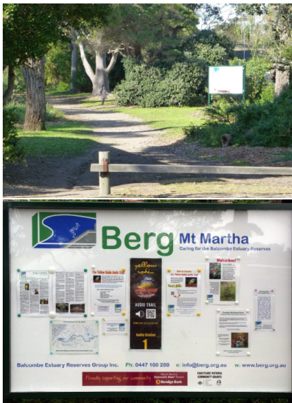
Top: The newly erected information board, from the entrance to the old Campground. Lower: the board now well populated.

Funded by Bendigo Bank, it will be regularly up-dated to tell visitors about the reserves and BERG Mt Martha, what's on, what's in flower, and the like.