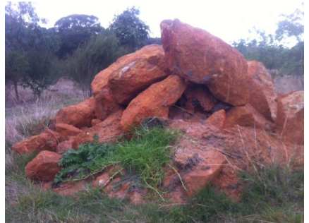
Red Mornington rocks waiting to be turned into lizard habitat

Landscaping will be underway by December in readiness for planting next autumn. There will be working bees and school activities as well as work done by contractors, and we will be using indigenous landscape materials including Mornington red rocks, logs and sand.