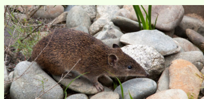
Southern Brown Bandicoot in the bushland at RBG Cranbourne